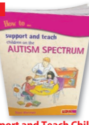
How to Support and Teach Children on the Autism Spectrum AAMT01151