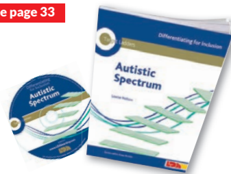
Target Ladders Autistic Spectrum AAMT12586