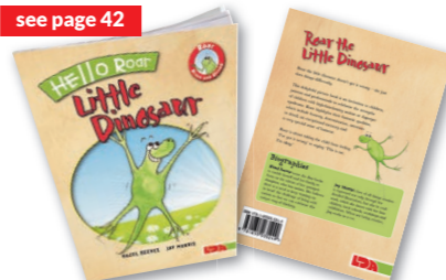
Hello Roar, Little Dinosaur ADMT12117